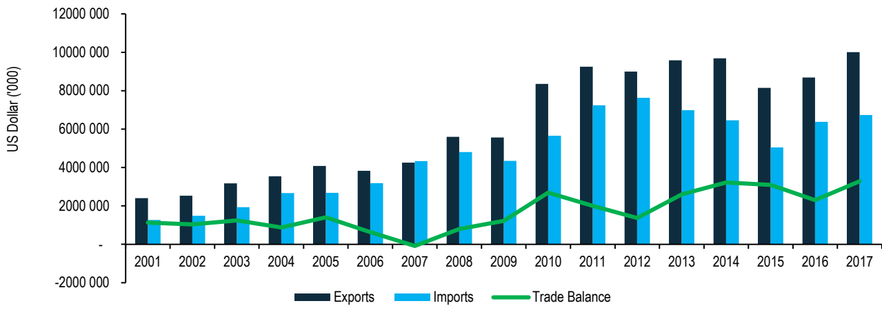
Chart 2: South Africa's agricultural exports